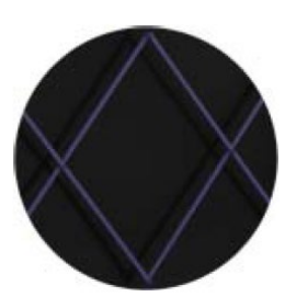
Double "X" screen mechanism